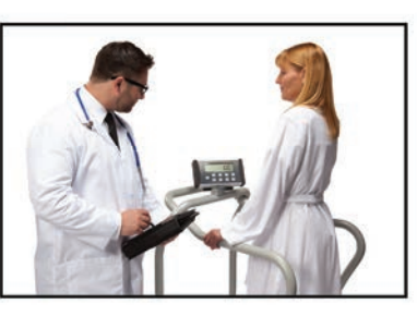
"LIVE" Handrails for patient stability