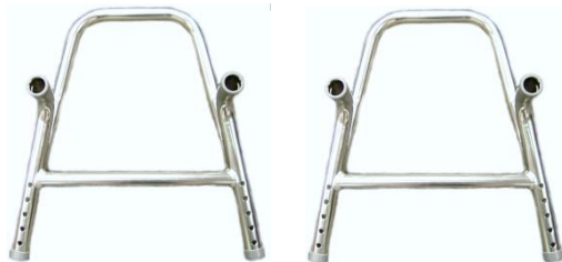
Part B & Part C