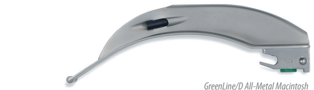
GreenLine/D All-Metal Macintosh