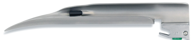
GreenLine/D All-Metal Phillips