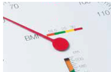
It is easy to determine BMI with the colorcoded dial.