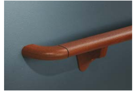
Please Call 800-323-4282