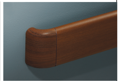
Please Call 800-323-4282