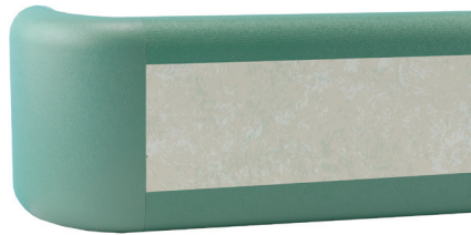
Please Call 800-323-4282