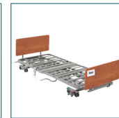
8" LOW BED