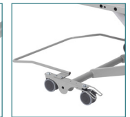
WALL BUMPER &