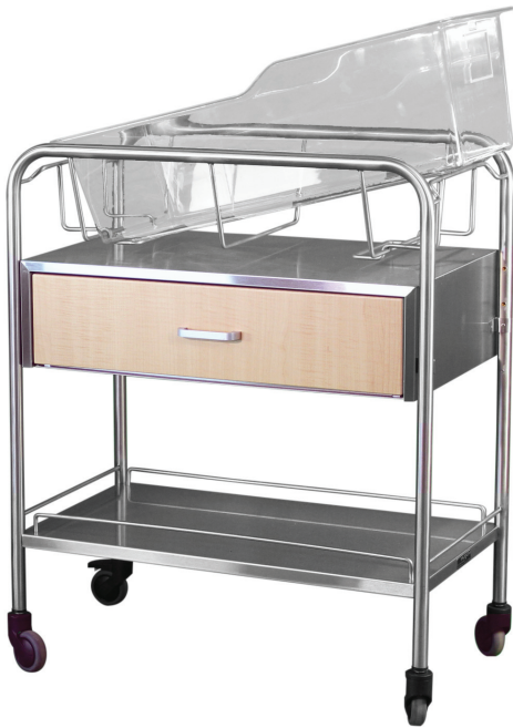
Pictured with optional polycarbonate basket and mattress pad