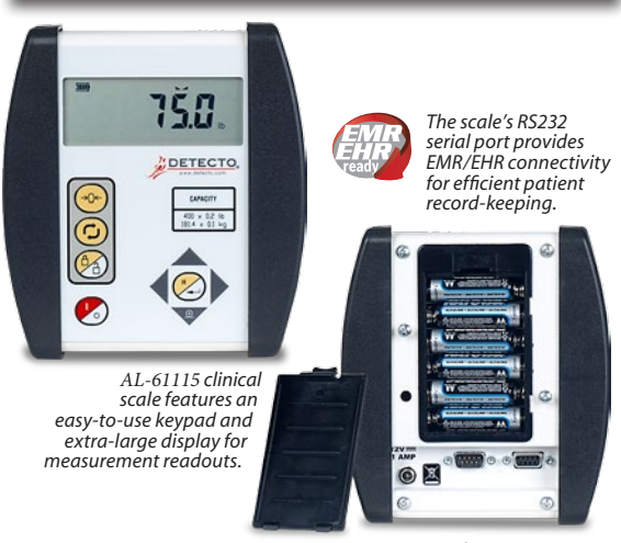
Uses 6 AA batteries (not included) or an optional AC adapter (AL-61114).

The AL-61115 clinical scale offers a variety of usages due to its unique product design and high capacity: standing, seated, and bariatric weighing. The wraparound stainless steel handrails with padded grips provide comfortable support for obese and unsteady patients. The 6868 is completely portable and can be transported easily due to its battery power and integral wheels (6 AA batteries not included).