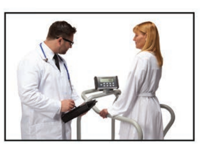
"LIVE" Handrails for patient stability